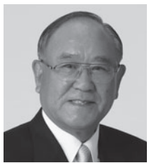
Fujio Mitarai Chairman & CEO / Canon Inc.