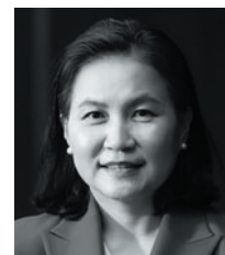
Yoo Myung-hee Former Trade Minister of the Republic of Korea