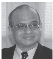
Brahma Chellaney Professor Emeritus, Strategic Studies at the Center for Policy Research in New Delhi