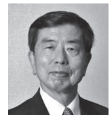
Takehiko Nakao Former President of the Asian Development Bank (ADB)